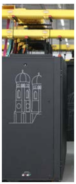
MUNICH SCIENTIFIC NETWORK, MWN