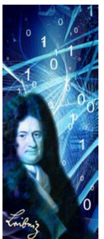
RESEARCH & DEVELOPMENT